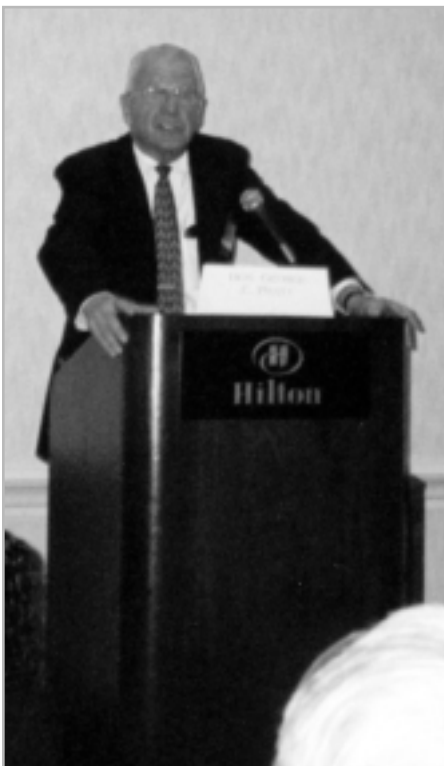
Top Left: Conversations were difficult to end when the breaks were over.