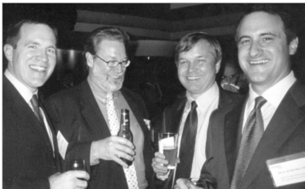
Above: ...with O'Doul's all around.

Editor's Note: For information about elections conducted during the Fall Conference, please see page 15.