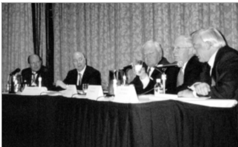
Top and Middle: Few seats were free in the Mercury Ballroom.