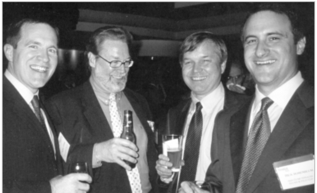
Above: ...with O'Doul's all around.

Editor's Note: For information about elections conducted during the Fall Conference, please see page 15.